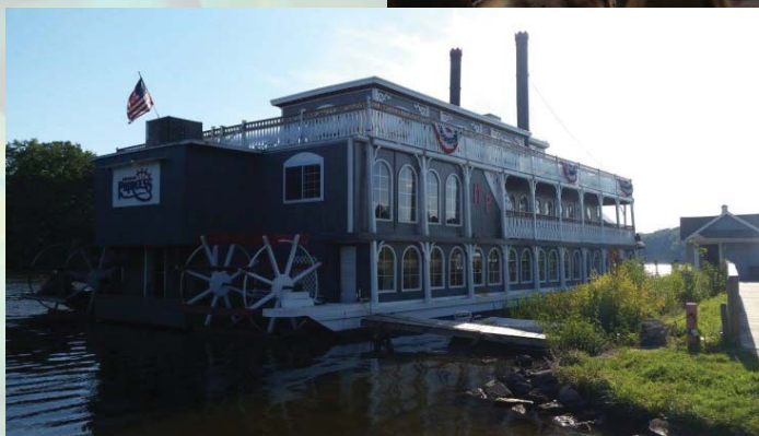
Left: Having the event on the Michigan Princess Riverboat, floating down the Middle Grand River, set the tone for the evening